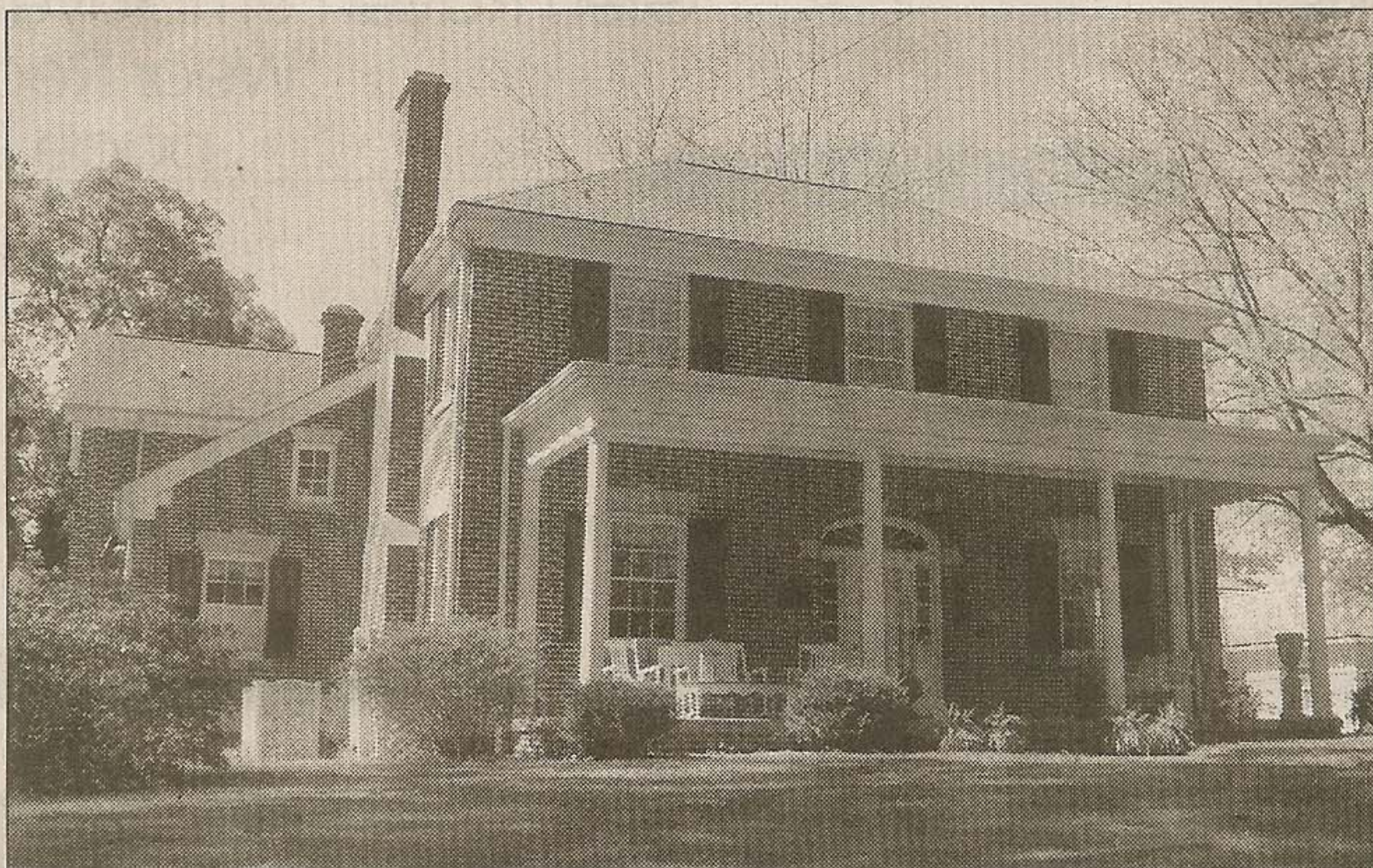
LUCI WELDON/The Warren Record

Oak Chapel AME Church, the second oldest church