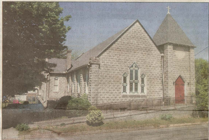
All Saints' Episcopal Church, located on the corner of Front and West Franklin Streets is an example of Gothic architecture and is part of the Preservation Warrenton 2012 Homes Tour.