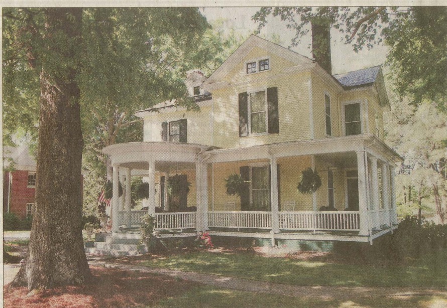
The Ivy Bed and Breakfast at 331 North Main Street is part of the Preservation Warrenton 2012 Homes Tour. The Queen Anne style house was built in 1903.